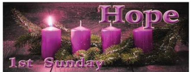
Lighting of the Advent Wreath

Saturday December 2nd Sunday December 3rd During advent Exposition of the Blessed Sacrament and a Holy Hour will be held each weekend during Advent one-half hour prior to the Masses on Saturday evening and Sunday morning